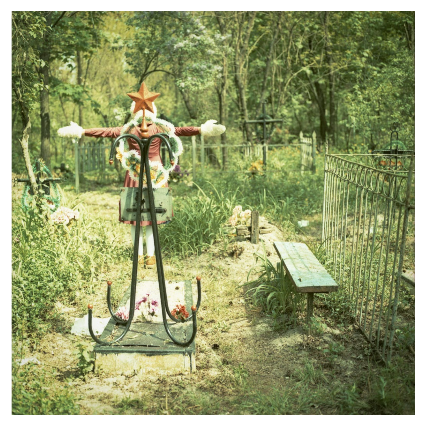
Star-face - Bober in a cemetery Bober / Ukraine