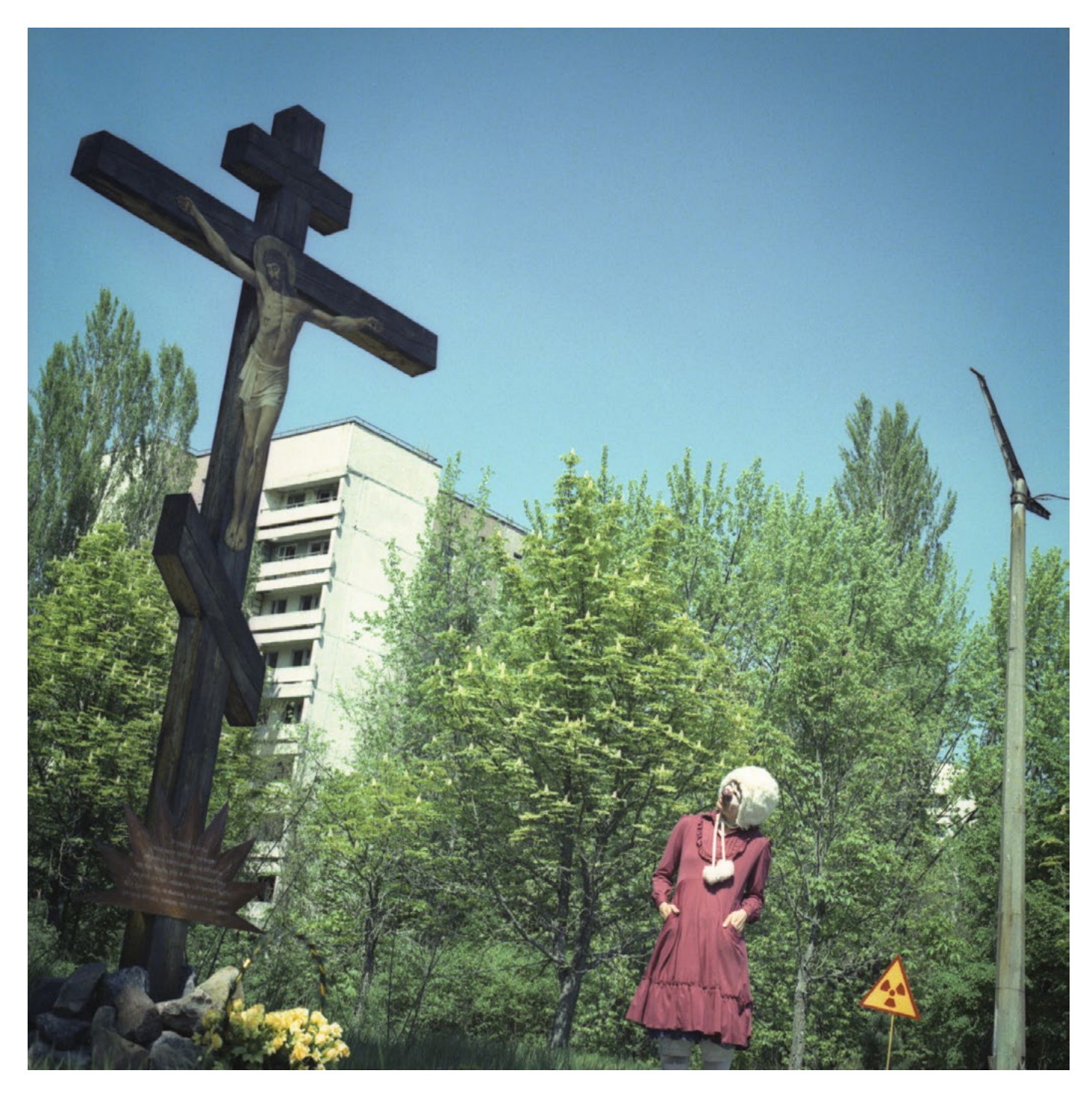
Doubt (s) – Bober in the entry of Pripiat Pripiat / Ukraine