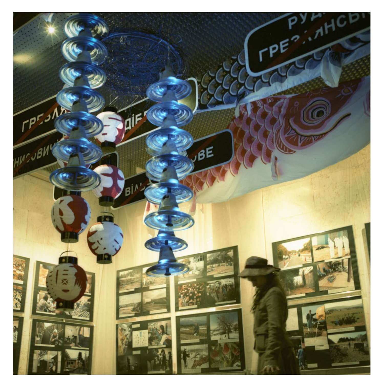
Lampion - Marie Poppet in the museum dedicated to Chernobyl Kiev / Ukraine