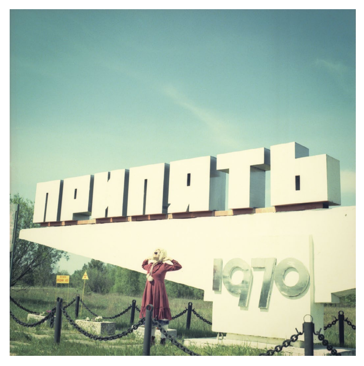
The awakening – Bober in the entry of Pripiat Pripiat / Ukraine